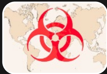
Emerging Infectious Disease